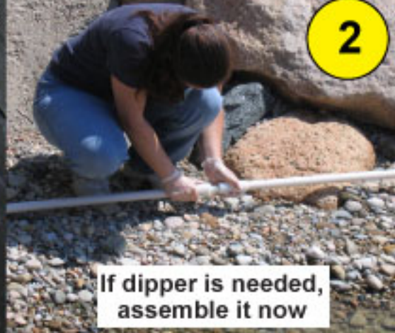
If dipper is needed, assemble it now