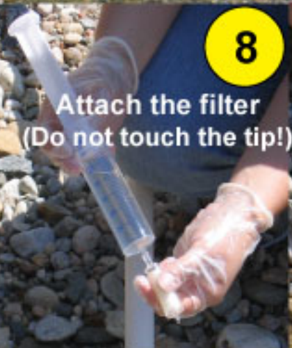
Attach the filter (Do not touch the tip!)