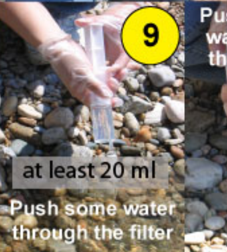
at least 20 ml Push some water through the filter