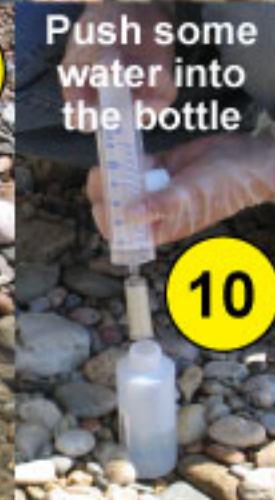
Push some water into the bottle