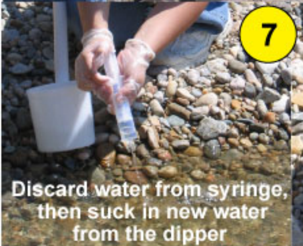
Discard water from syringe, then suck in new water from the dipper