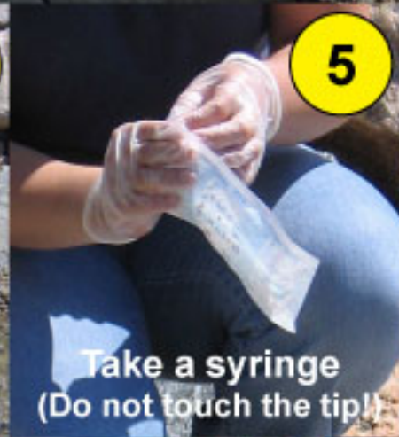
Take a syringe (Do not touch the tip!)