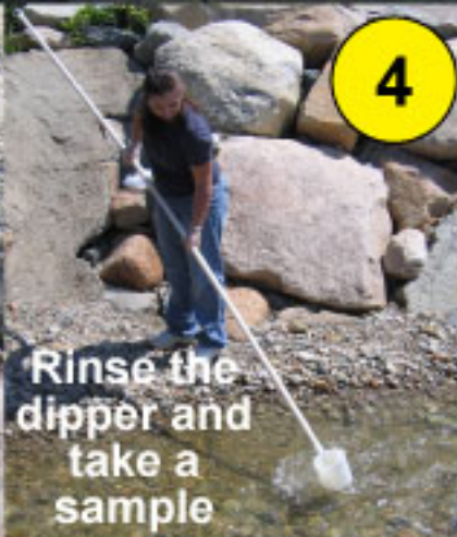
Rinse the dipper and take a sample