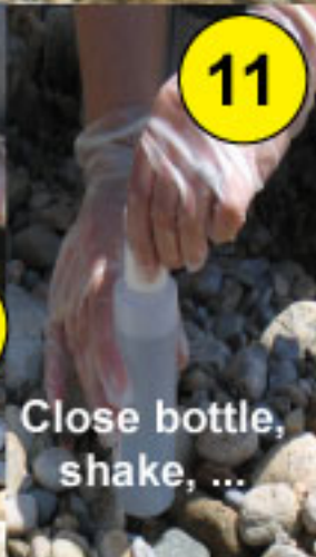
Close bottle, shake, ...